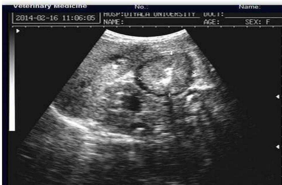
Fig.(5): Ultrasonography image (of dog liver enlarged and a large solid nodule ,rounded, outlined by peripheral hypoechoic halo apparent ,the central portion of lesion is more echogenic and measured 42x42 mm.(delineated by dotted line)

Ultrasono -graphic (US) examination was performed trans-abdominal using a real-time B-mode scanner. Liver: Hepatomegally with large nodule outlined by peripheral hypoechoic halo apparent, the central portion of lesion is more acrogenic and measured 42x42 mm as in figure (5). Gallbladder: No stone and normal size. Spleen: Normal in size, shape and echogenicity with no focal lesion appreciated. Kidneys: Both kidneys were normal in shape, size and contour. Stomach: Appeared with markedly thickened wall and normal motility.